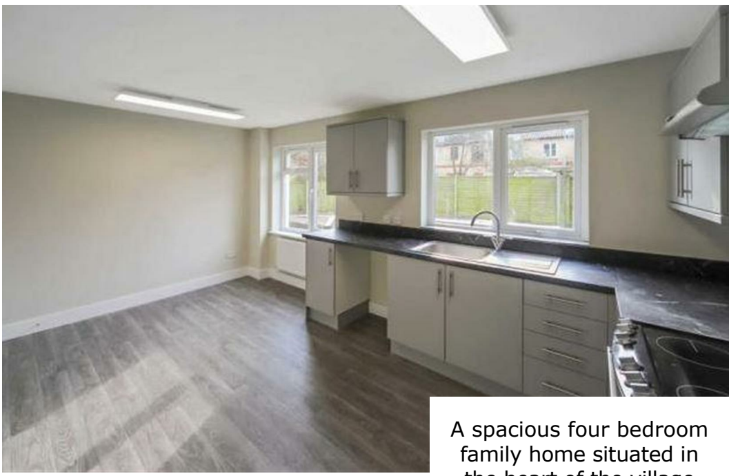
A spacious four bedroom family home situated in the heart of the village with no onward chain complications.